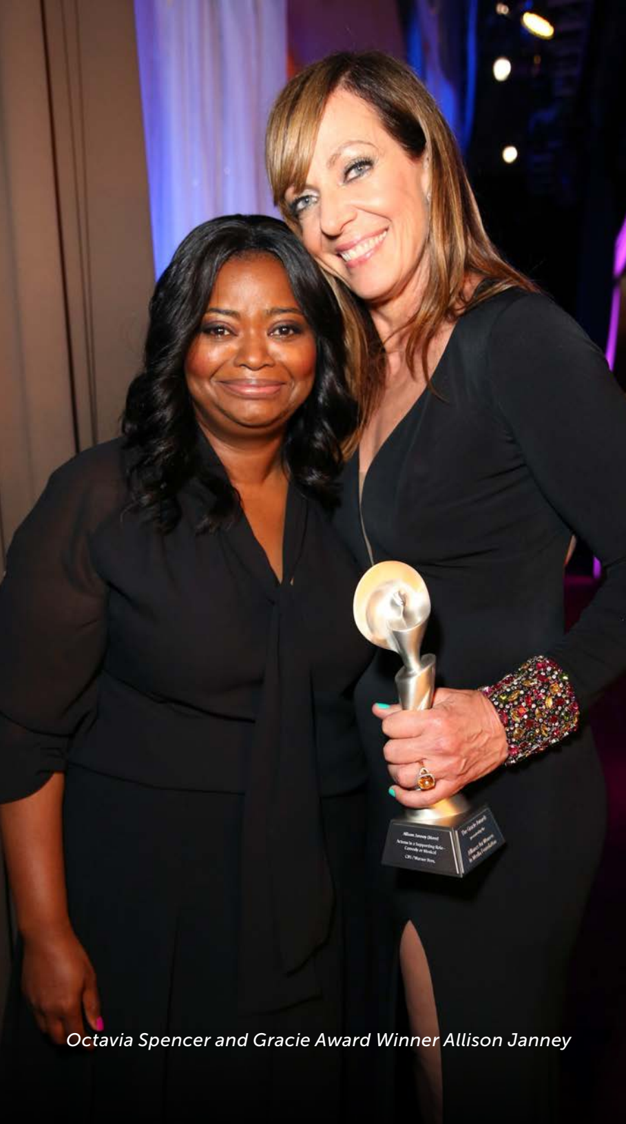
Octavia Spencer and Gracie Award Winner Allison Janney